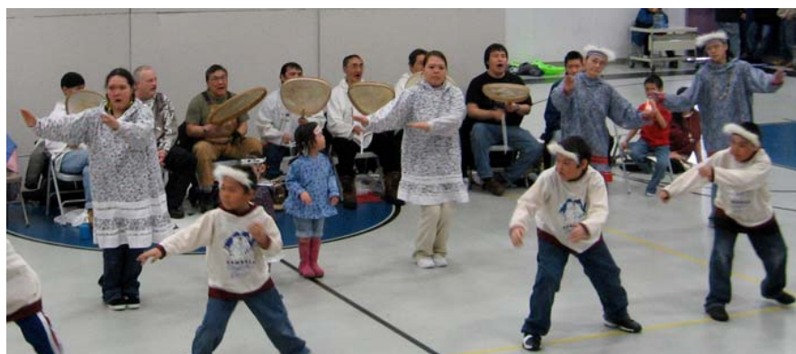
Figure 3 Eskimo Dance Programme at school in Gambell, St. Lawrence Island, Alaska.