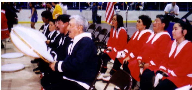
Figure 5 Nuvukmiut [‘people from Point Barrow’] Dance Group performing in the World Eskimo Indian Olympics in Fairbanks, Alaska. July 2002.

One of the most striking comments I repeatedly and explicitly heard from Iñupiat in the younger generations is that singing songs in the Iñupiaq language is a way to learn and preserve their endangered language. In fact, memorising Iñupiaq songs is an activity that occupies considerable time and energy in the life of the young drummers. Among the Barrow Dancers, almost all active members are either teenagers or people in their twenties and many of them told me that developing the ability to sing songs in Iñupiaq is one of the most important means of learning the language. Some of them explained that learning Iñupiaq in school or attending Iñupiaq church service requires great effort. Singing songs in Iñupiaq with their peers, on the other hand, is much more enjoyable. In other words, singing Iñupiaq songs is a less demanding language exposure task, during which particular specialised genres can be acquired and during which, thus, a form of language proficiency can be constructed in Iñupiaq.